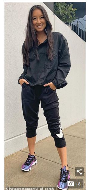
Even her much-loved coffee was leaving her anxiety-ridden and suffering from panic attacks after each caffeinated sip