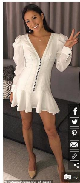
Even her much-loved coffee was leaving her anxiety-ridden and suffering from panic attacks after each caffeinated sip